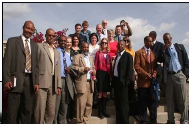
Canadian Delegate in Ethiopia. June 2008 Conference to help build higher education at AAU